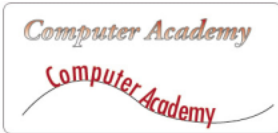
Text can be converted to outline (top) Text can be typed along a path (bottom)